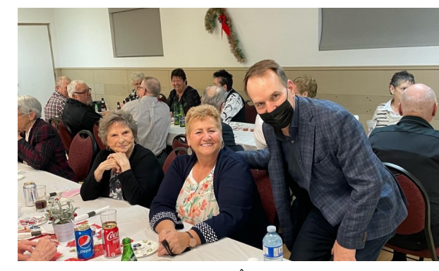
Supper at the Club de l'Âge d'Or de Templeton

We have worked hard to strengthen the financial security of lowincome seniors. That's why we introduced Bill C-12, to help seniors who received pandemic benefits and saw a reduction in their