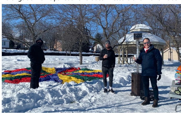
At Lavictoire Park during the Café hivernal organized by the Comité de Vie du quartier du Vieux-Gatineau