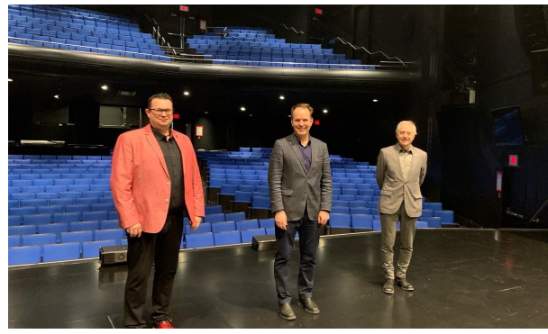
Visit to the Maison de la culture de Gatineau to announce funding through the Canada Arts Presentation Fund