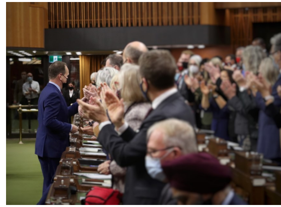
As Chief Government Whip for the first vote of the 44<sup>th</sup> Legislature in the House of Commons