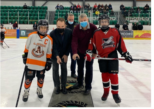
At the 52nd edition of the Gatineau PeeWee Tournament