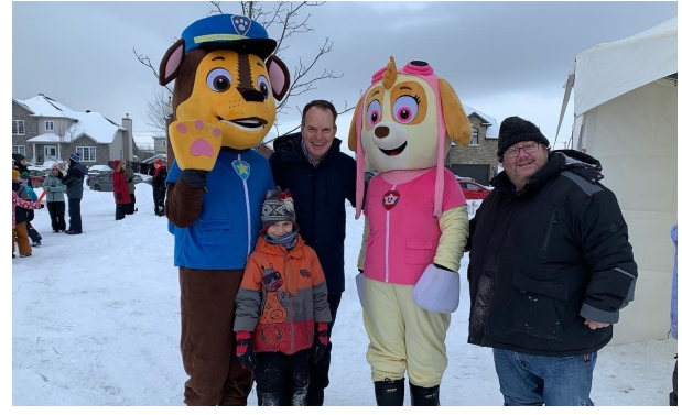
Fête des neiges organized by the Association des résidents de Bellevue-Nord