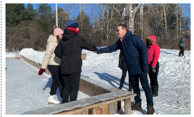
Meeting with you at the skating rink in Henri-Dunant Park