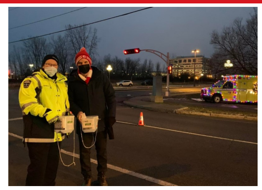
At the 21st edition of the Media Food Drive alongside the Coopérative des paramédics de l'Outaouais