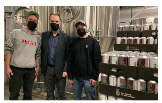
Visit to the Brasserie du Bas-Canada in honour of their 4th birthday

<u>For more information:</u> www.canada.ca/economic-response-plan