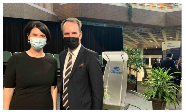
With the Mayor, France Bélisle, during the swearing-in ceremony of the new municipal council of Gatineau